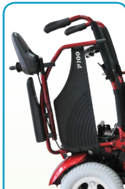
FLIP BACK ARMRESTS