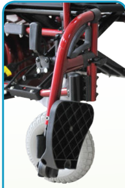
S/A DETACHABLE FOOTREST