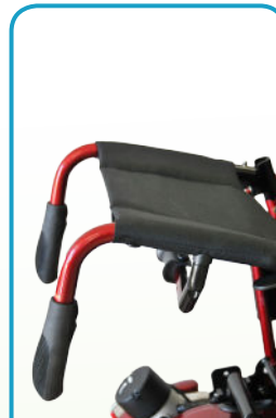
HALF FOLDING BACKREST