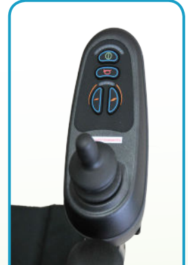
USER FRIENDLY ELECTRONICS