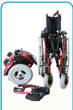
COMPACT & FOLDABLE